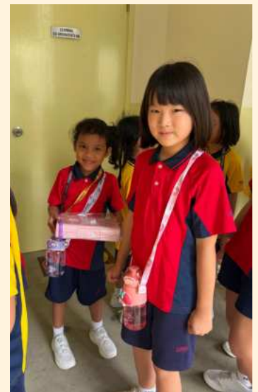
Big buddies, little buddies – growing and learning together from day one