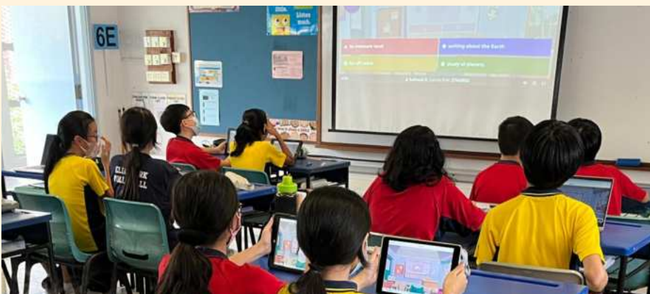
Students using ICT tools for collaborative learning and formative assessment

As students navigated new digital tools, they demonstrated resilience, adaptability and patience. Many also stepped forward to support their classmates, showing leadership and kindness. Through these experiences, the EPPS values of endeavour, love, and integrity were clearly displayed.