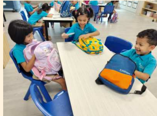
Building confidence, friendships and joyful memories, one lesson at a time