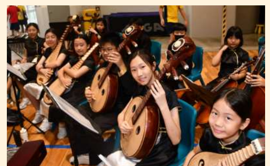
ECHO at 2026 Singapore Youth Festival Presentation