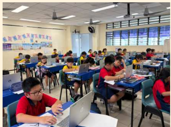
Making learning fun and engaging through digital learning experiences.